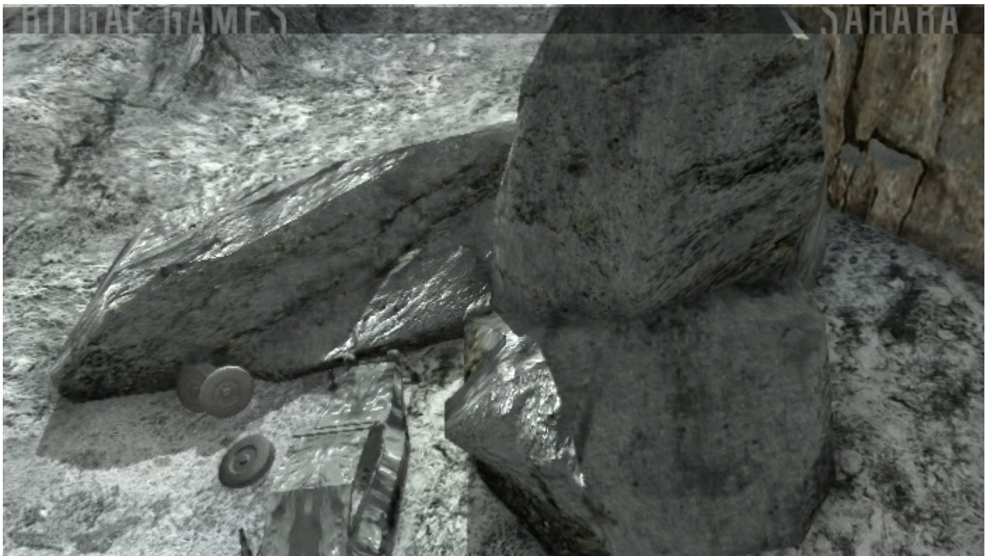
Familiar shapes covered in ice. These are standard models in the Torque 3D game engine.