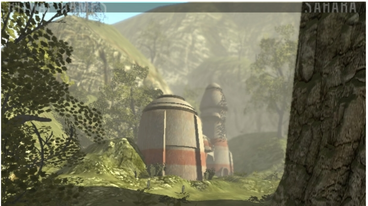
A lush green environment made with Torque 3D Professional 2009 1.1 Beta 2 and Bitgap Games' Sahara 1.0 in a matter of minutes.

If you do not meet these requirements and you still try to use the accumulation feature of Sahara, you will receive a warning in the console about it.