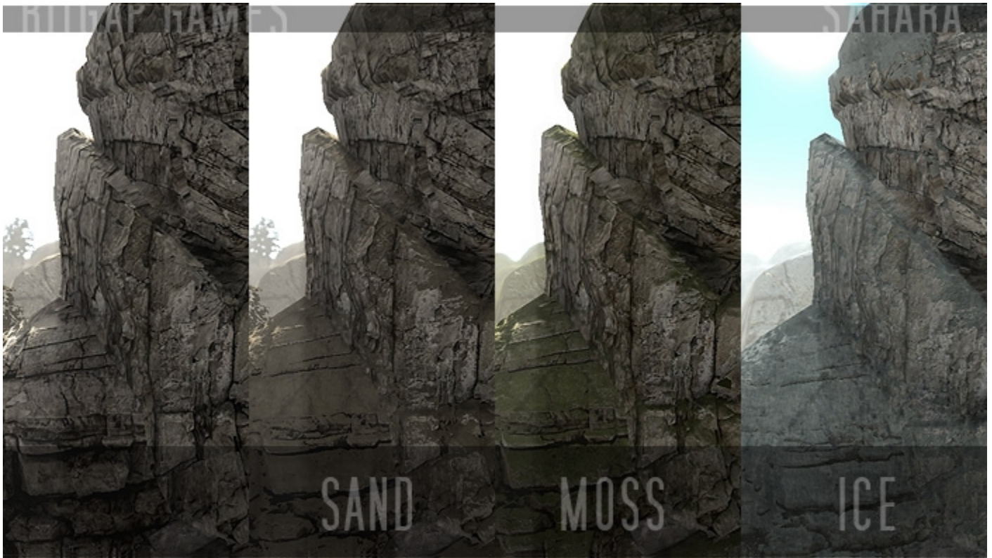
An Accu Map on a shape can boost the visuals within any game environment.